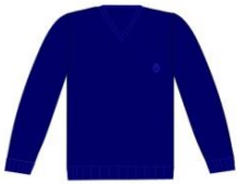
CASACO DE LÃ